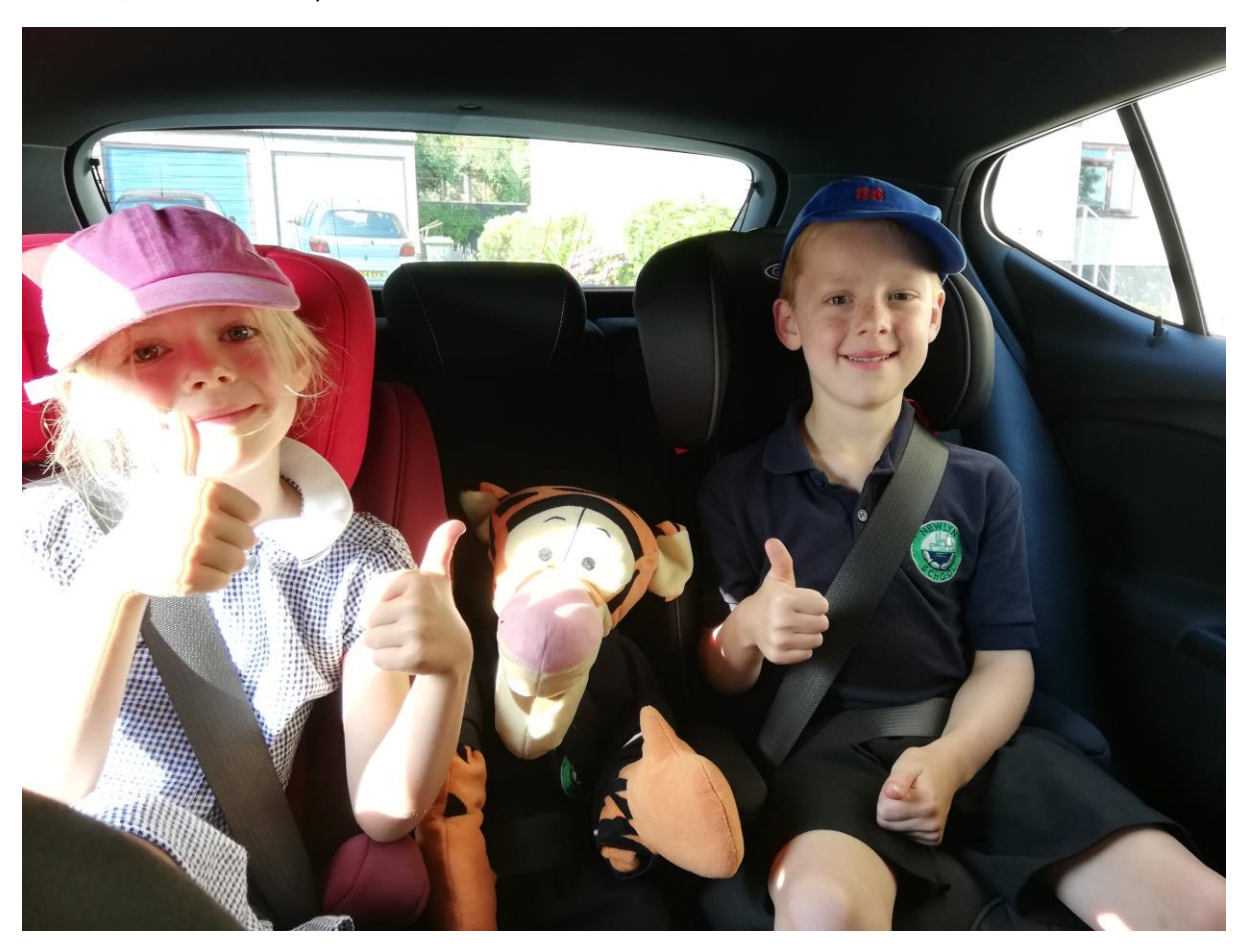
To Close, here are some photos from the session: